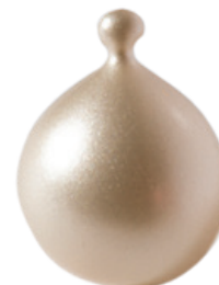
SHAPE: 90 TOT F FILL VOLUME (ML): 5.00