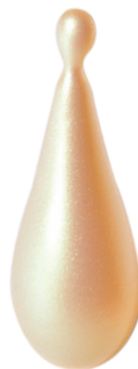
SHAPE: 80 TOT B FILL VOLUME (ML): 2.90 - 3.00